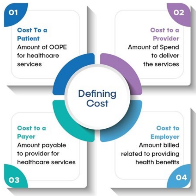
Fig1: Price Transparency would help patients to improve their understanding of costs, preventing surprise medical bills etc.

Charges, Price, and Cost are the three main aspects of price transparency within healthcare. Charges are the amount set by the provider for services rendered before discounts and it is usually different than the actual amount paid by the consumers, whereas Price is the amount expected by the healthcare providers to receive from payers and patients, and Cost has a different meaning for entities that are incurring expenses (patient, provider, payer, employer) as shown below: