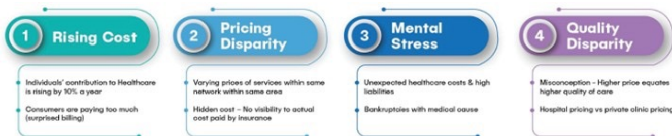
Fig 3: Summarizes the current pressures consumers face and the need for more healthcare price transparency.